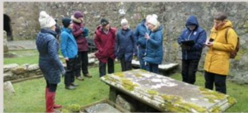
Eaglais na h-Aoidhe