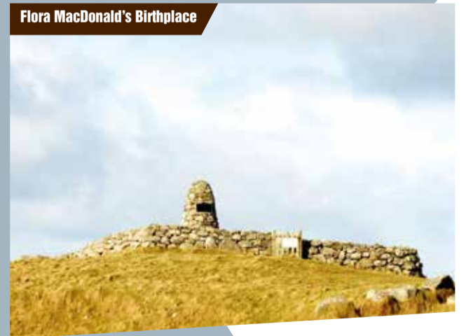
Flora MacDonald's Birthplace

“This is a great walk, which is well worth a full day out with a picnic lunch on the amazing silver sand beach and then finishing with cake and a cup of tea at the café at the South Uist museum. The walk takes in the Flora Macdonald birthplace monument, quiet roads through crofting communities, the outstanding machair of South Uist and a secluded beach.”