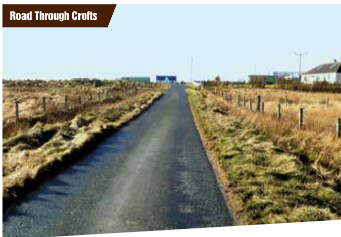
Road Through Crofts

walking through machair fields. Machair (a gaelic word meaning fertile plain) is formed by the sand from the beach, the remains of crushed up shells, being blown inland onto the naturally peaty soils. In spring and summer the machair boasts a multitude of flowers: daisies, primroses, buttercups, bedstraws, trefoil, vetches and more. Exactly which flowers are in bloom depend upon the time of year and the individual location.