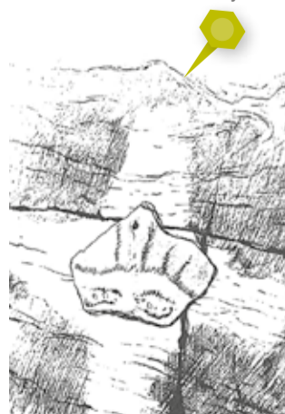
10th Station of the Cross (Jesus is stripped of his garments)

Some people think this resembles a huge fossil, although no dinosaur fossils have been identified from the Western Isles. Have a look for yourself and decide whether dinosaurs roamed Eriskay.