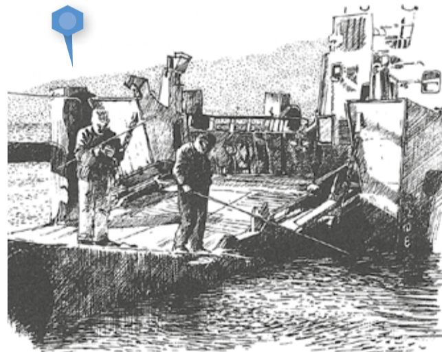
Fishing for Cud