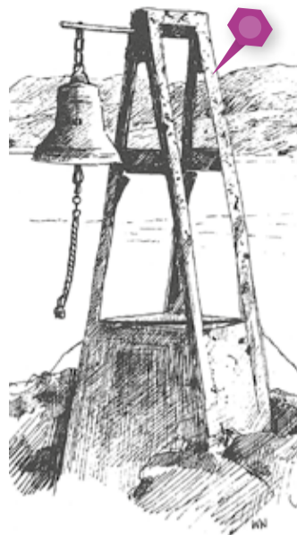
Bell from battleship 'Derlinger' scuttled in Scarpa Flow in 1919

Compton Mackenzie's famous novel (and subsequent film) Whisky Galore. Inside the pub there is information and memorabilia commemorating this event.